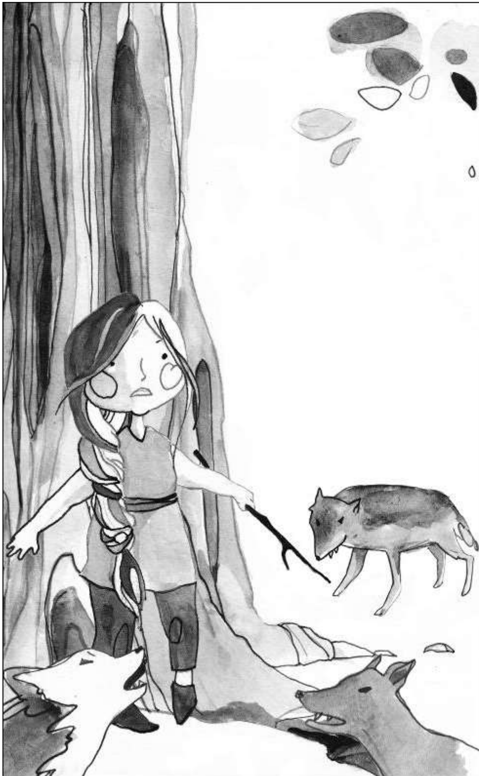
The wolves snapped closer and closer.